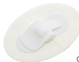
Optional Securement Device