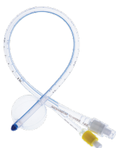
Cervical Dilating Balloon